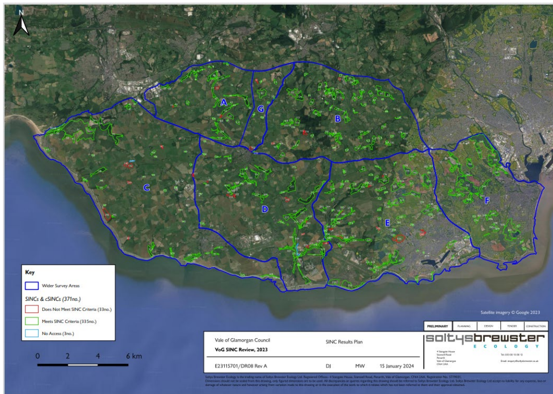
Figure 2: Vale of Glamorgan SINC Review 2023 SINC Results Plan.